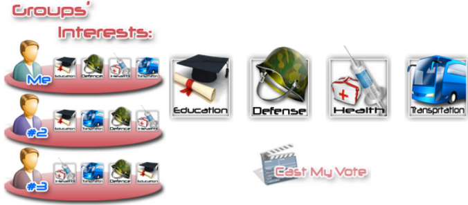
Figure 1: Snapshot of the Budget Allocation Game

This profile incurs utilities of three points for agent 1, five points for agent 2 and two points for agent 3.